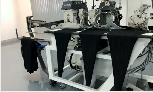
传统折叠收料，无法满足裤约克的裁片需求，同时后拉式克服了尺码大小不一的困扰 Traditional folding collection, can not meet the needs of the trouser York cutting, while overcome the trouble of different sizes

定制后拉式收料机构 Custom pull-up collection mechanism