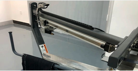
积极主动式收料 Proactive collection